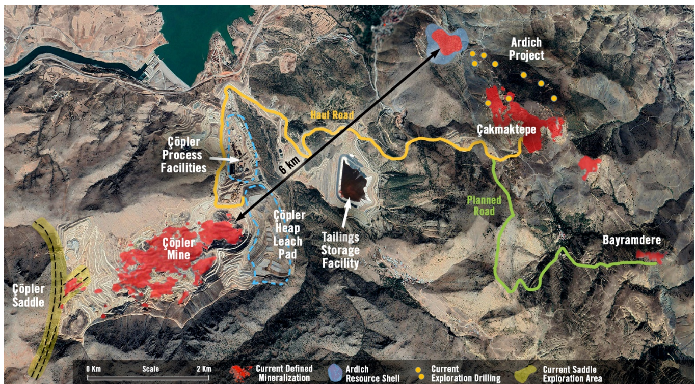
Figure 1. Location map of the Çöpler Saddle Shear Zone.

Rod Antal, Alacer’s President and Chief Executive Officer, stated, “The Çöpler Saddle is shaping up to be another outstanding near-mine exploration project and an important component of our short-term strategy to identify additional oxide ore that we can convert quickly into production by leveraging our existing infrastructure. With Ardich already shaping up to be a major discovery, and now with The Saddle showing potential, albeit at an earlier exploration stage, our short-term strategy is rapidly becoming a reality.”